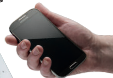
Tablet and phone not included

"Use your own tablet, smartphone or laptop and payment device"